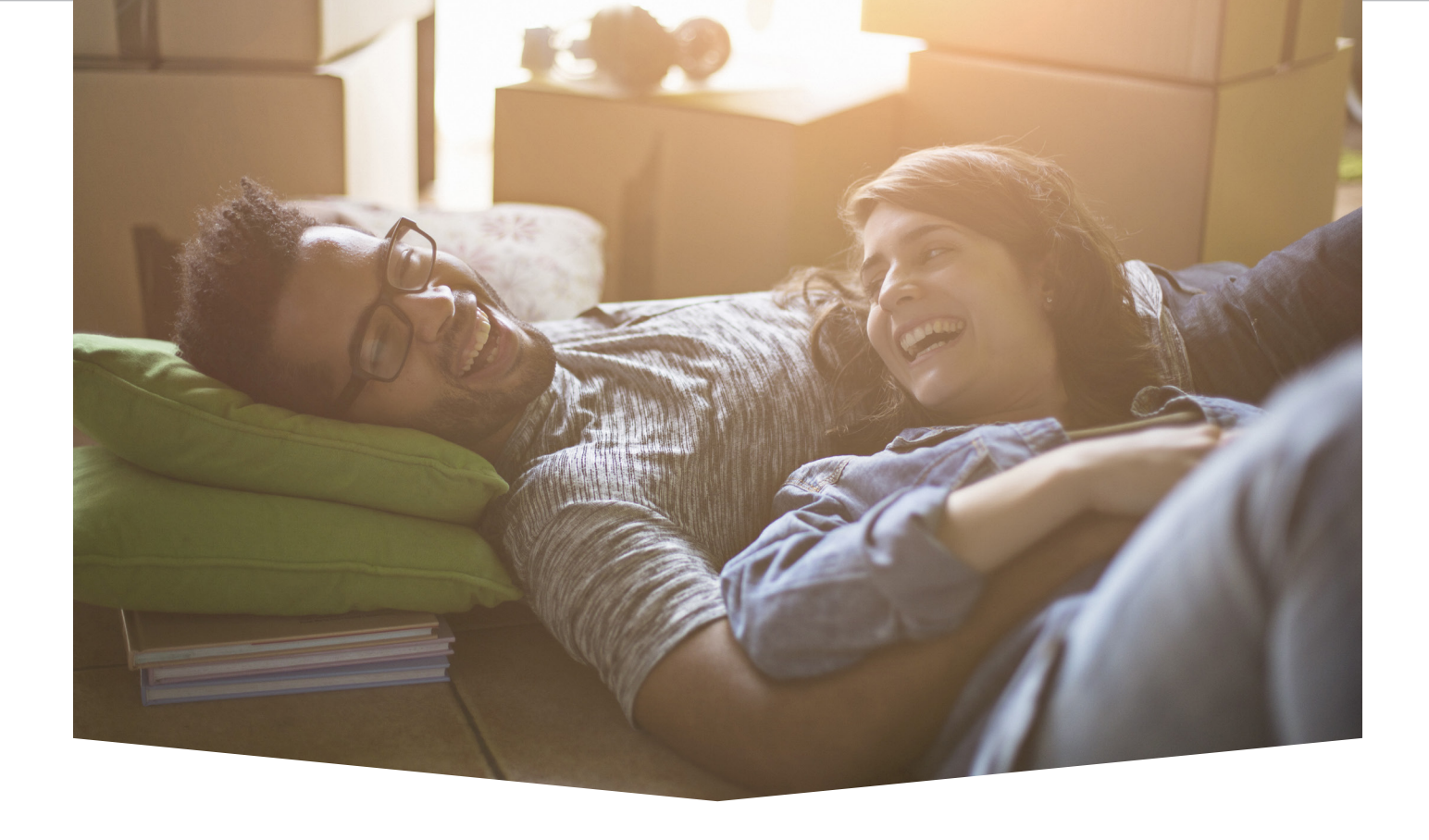
Pack a "first day" box with items you will need right away.